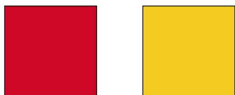
Inside zipper lining